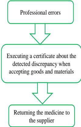
Flow chart 3. Organization of the hospital work when detecting a professional error in supporting documents for medicines from suppliers