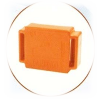
Figure 1 - Identifier and pedometer "AfiTag"

To solve the set tasks, we have formed 3 groups of cows: in 1^{st} group included 148 first-calving cows, the 2nd - 105 cows in the second lactation and the group 3 - 97 cows in the third and older lactations. Starting from June 28 until August 20, 2016, the experimental cows were sampled in the estrus period using the AfiTag pedometer and the AfiFarm computer program. The detection of estrus is based on the relationship between estrus and increasing the movement activity of cows. AfiTag includes a device that counts the number of steps passed by the cow (Figure 1). These data are automatically transferred to the computer. The AfiMilk system analyzes the information received and identifies cows in estrus [5].