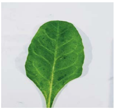
Fig. 1.1 Spinach leaf

Flowers: Flowers axillary, sessile, crowded,very numerous, stamen 4, anthers twin, sessile, calyx 4- parted, very large.