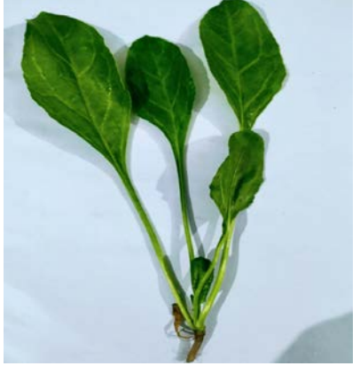
Fig. 1.2 Spinach plant