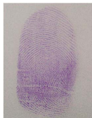
Fig-5- double loop