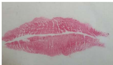
Fig-1- vertical lip print

The results were tabulated in MS excel and the statistics were using SPSS software.(version 20.0)