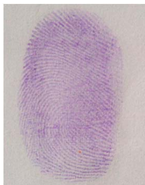
Fig-6- plain loop