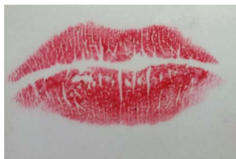
Fig -3- branched lip print