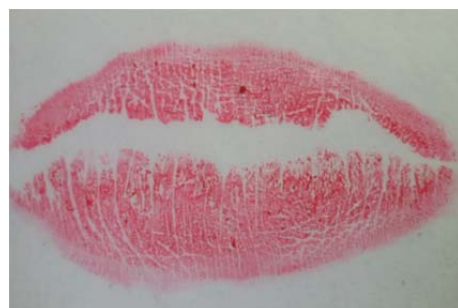
Fig-4- intersecting lip print