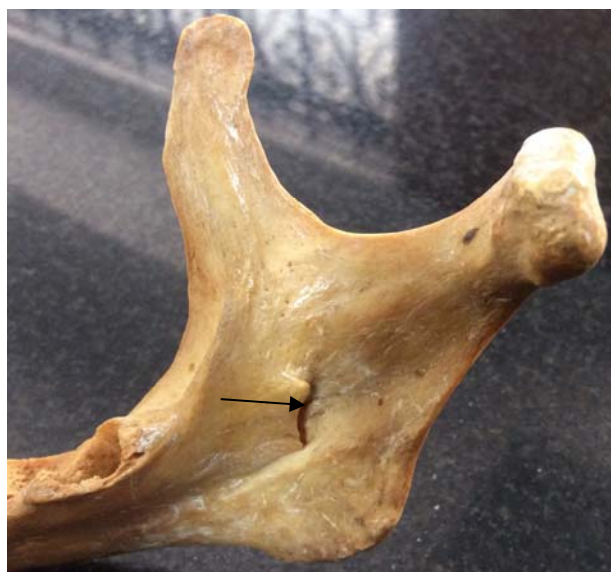
Figure 8: Nodular lingula process