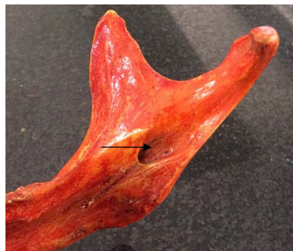
Figure 7: Assimilated lingula process