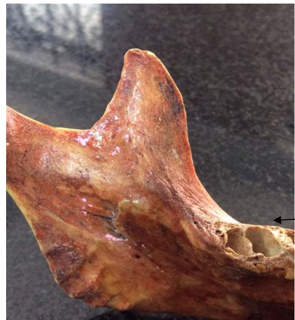
Figure 6: Truncated lingula process