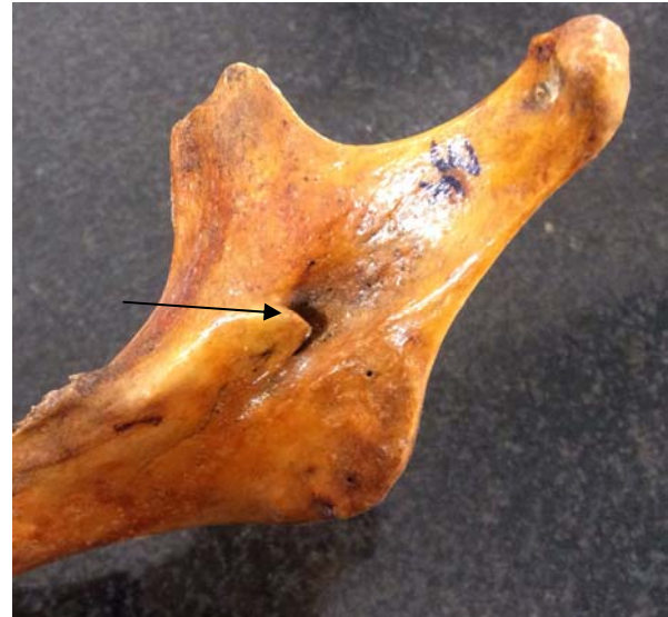
Figure 5: Triangular lingula process