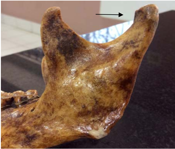
Figure 3: Hook shaped coronoid process