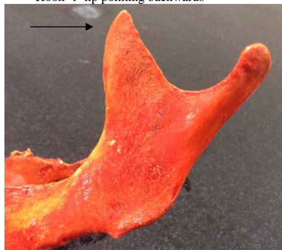
Figure 1: Triangular coronoid process