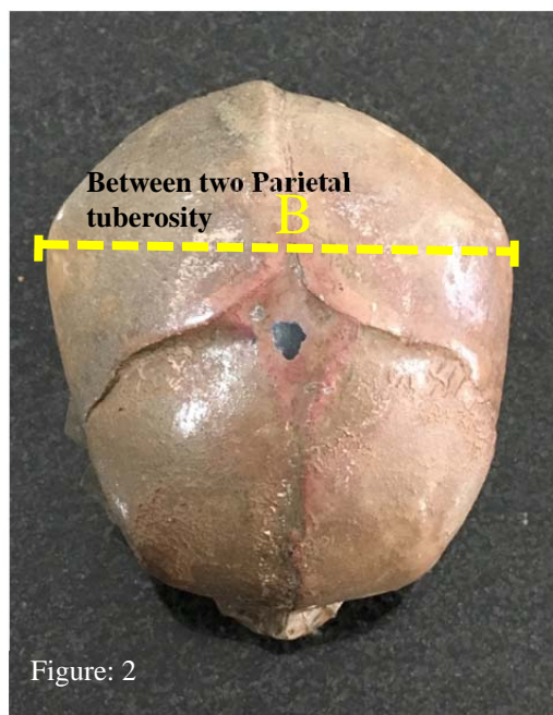
Figure: 1 & 2 shows the Maximum Cranial Length (A) and Maximum Cranial Breadth (B) of Cranial Index (CI) in foetal skull.