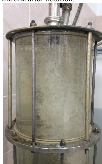
Figure 2 – Disperser in action

Figure 4 represents photos of the starting oil and water emulsion and the one after flotation.