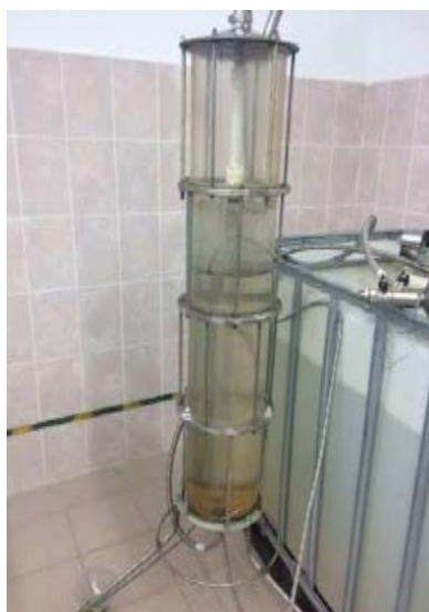
Figure 1 – A device for flotation purification of oil and water emulsions

In order to purify the model oil and water emulsion from oil products, a new design of a jet film bubble generator has been developed allowing for producing air bubbles less than 100 microns in size in water. The use of this generator provides for maximum saturation of oil and water emulsion with air and increases the oil product removal efficiency. The generator developed and reviewed in this paper has the following technical advantages: